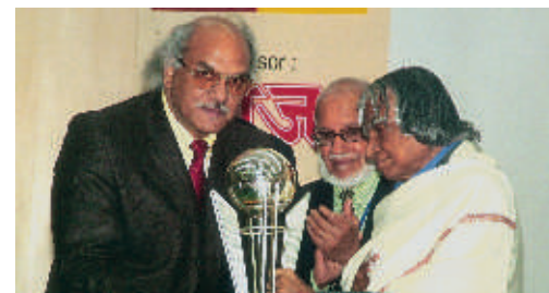
Indian Innovation Award

Felicitated for the Pioneering Initiative of Accepting NIELIT Qualifiers for Higher Courses