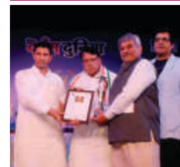
Dabbang Duniya Award