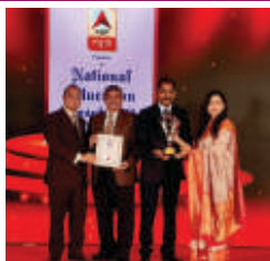
ABP National Edu. Award