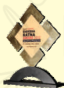
Shiksha Ratna Award 2012